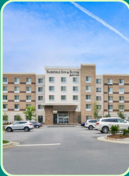
FAIRFIELD INN & SUITES BY MARRIOTT RALEIGH CARY