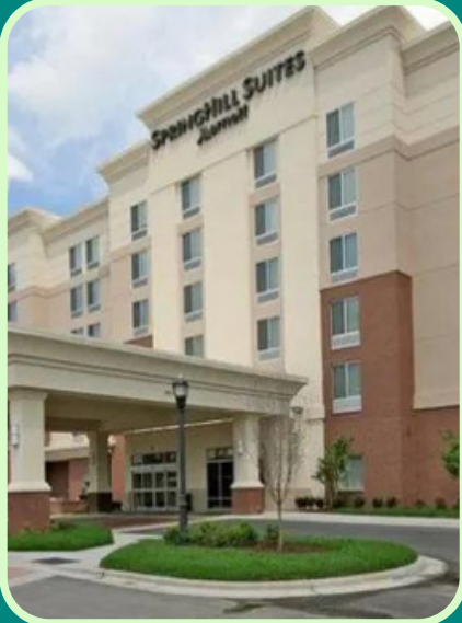
SPRINGHILL SUITES BY MARRIOTT RALEIGH CARY

Hotel Room rates vary and are reasonably priced for travelers visiting the Cary/Raleigh, North Carolina area.