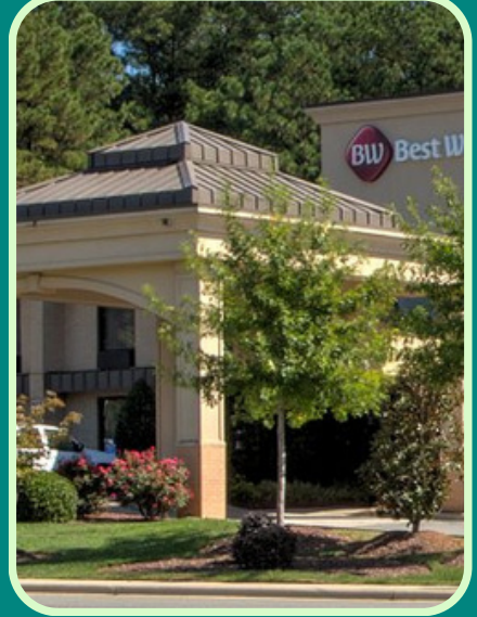
BEST WESTERN PLUS CARY INN - NC STATE