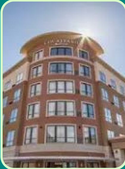
COURTYARD SOUTH BEND DOWNTOWN

21 S Dr. Martin Luther King Jr South Bend, Indiana, 46601