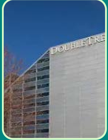
DOUBLETREE BY HILTON HOTEL SOUTH BEND

123 N. Dr. Martin Luther King Jr. South Bend, Indiana, 46601