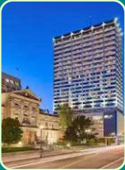
ALOFT SOUTH BEND

Hotel Room rates vary and are reasonably priced for travelers visiting the South Bend, Indiana area.