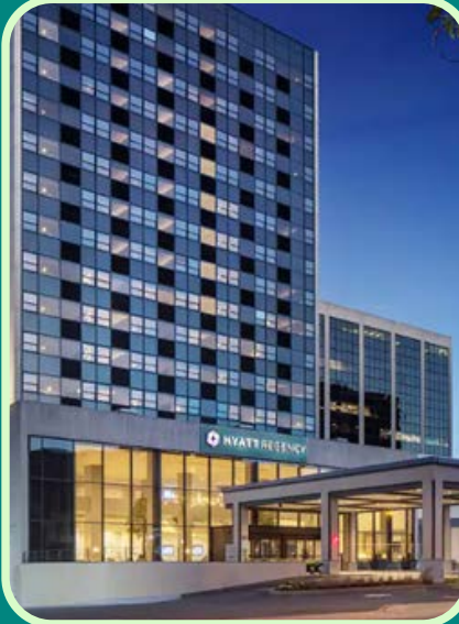
HYATT REGENCY MORRISTOWN

Hotel Room rates vary and are reasonably priced for travelers to the area.